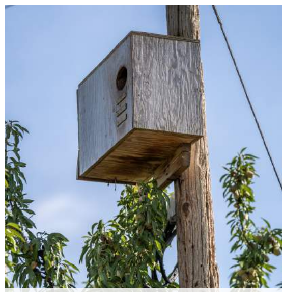
Research shows that owls may prove helpful in managing rodents.

Gopher pressure can be increased by cover crops because the crop biomass provides a food source and may hide gopher signs. The risk of increased rodent pressure is higher in young orchards because rodents can kill young trees. You may choose to limit inclusion of legumes, particularly clovers, because of rodent preference for these species, though site-specific factors will affect rodent population pressure and preference.<sup>5</sup> Careful and consistent monitoring is important, along with proactive control of any emergent gopher problems. Additional strategies, such as owl boxes, show potential as part of a whole-farm management strategy for rodents,<sup>6</sup> and on-farm guidance for their use is available for growers.7