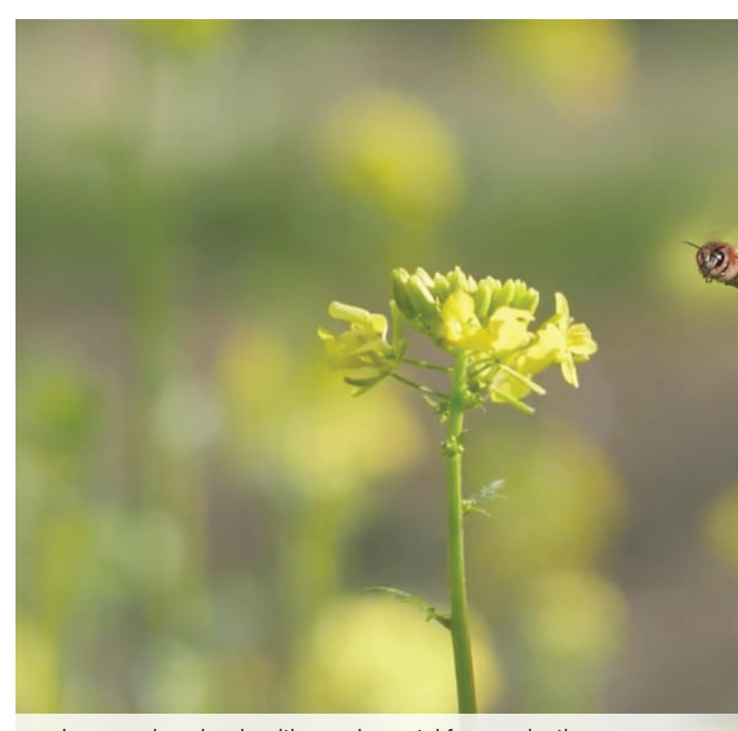
In general, orchards with supplemental forage plantings tend to have higher nut set than those without plantings.<sup>15</sup>

To maximize the presence of beneficial insects and native pollinators, try to provide additional permanent and well-protected habitat so that pollinators and beneficials have somewhere to disperse to when cover crops are mowed.