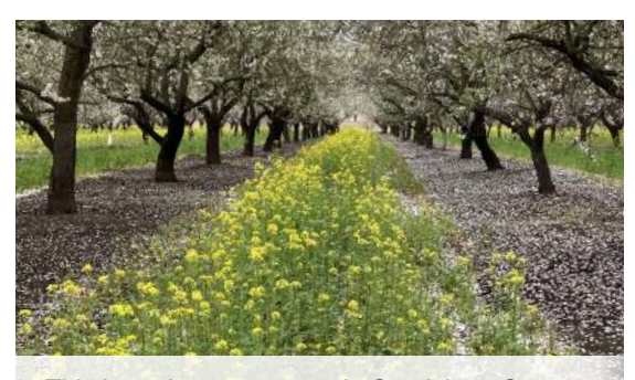
This brassica cover crop in Stanislaus County was broadcast seeded in mid-November and irrigated at the same time as the trees.

Be prepared to adjust your cover crop mix and management to match your goals and experience over the life of your orchard(s).