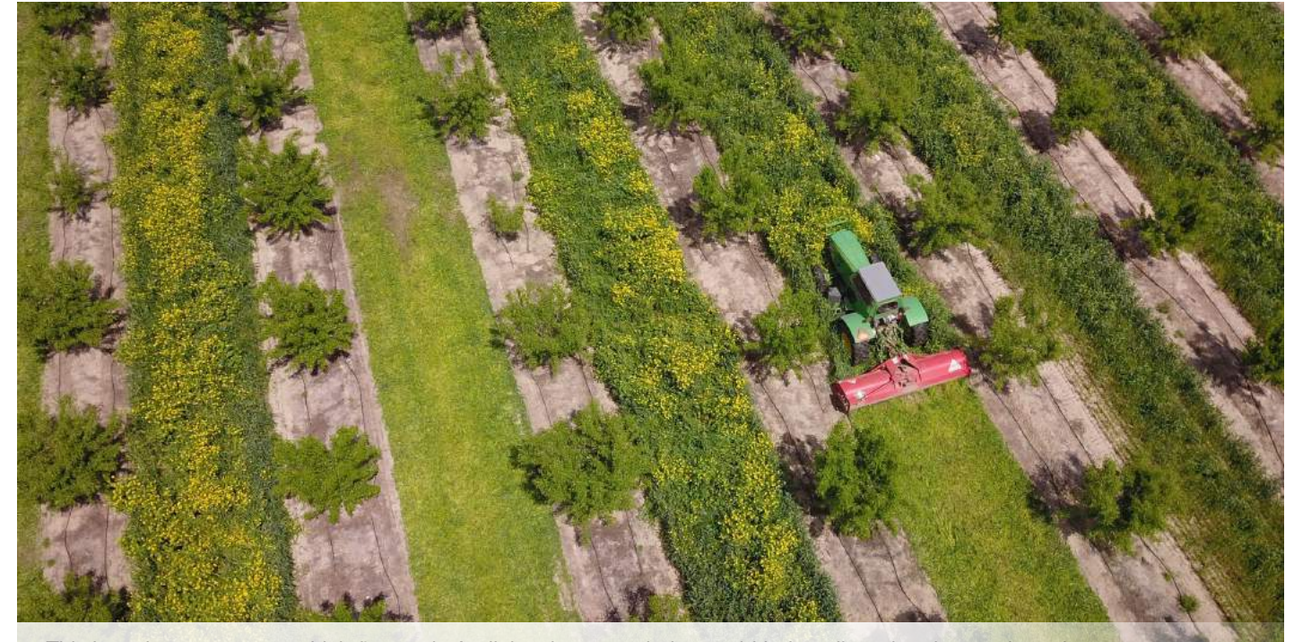
This brassica cover crop, which flowers in April, has been seeded at a width that allows it to be terminated with a single pass of the flail mower.