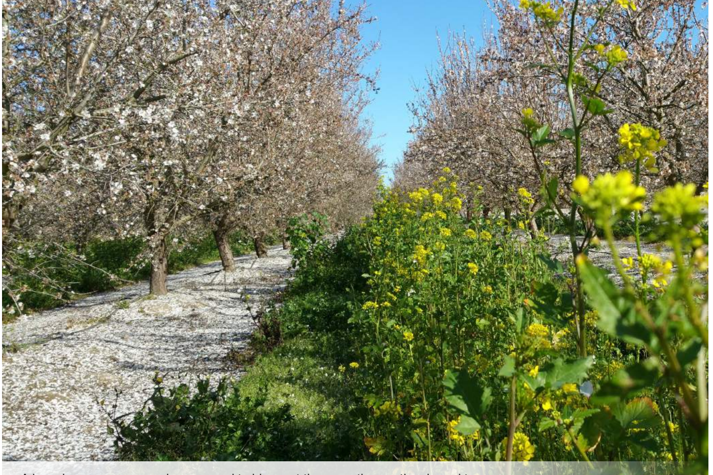
A brassica cover crop can be managed to bloom at the same time as the almond trees.